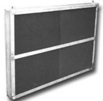
Retpak Media Pack