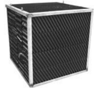
Flopak Media Packs